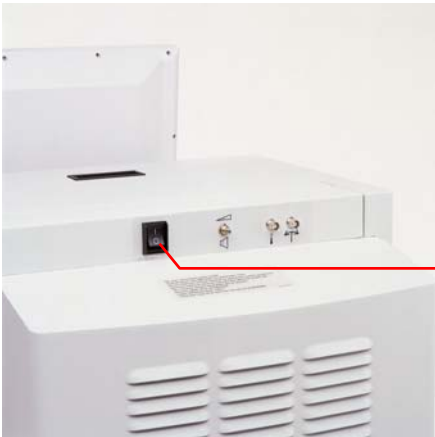
Console power switch