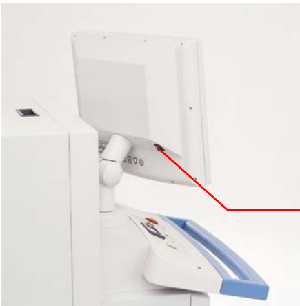
Touch screen power switch